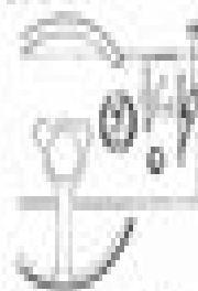
Fig. 1 Transaxmission lever