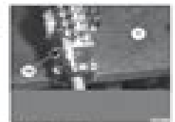
Fig. 5: Disassembly of the governor assembly