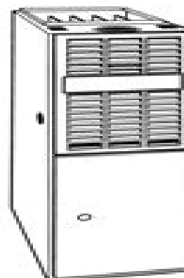
Fig. 2—Model 58RAV Downflow