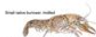
Fallicambarus fodiens Digger Crayfish max. carapace length 10cm