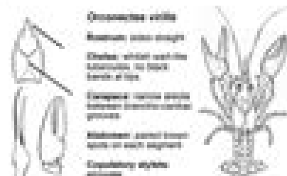
Orconectes virilis Rostrum: sides straight Chelae: white, ventral surface to dark bands at tips Carapace: narrow, smooth, with transverse carapide process Abdomen: jointed, lower part in each segment Respiratory apophysis: straight