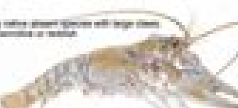
Cambarus robustus Big Water Crayfish max. carapace length 10cm