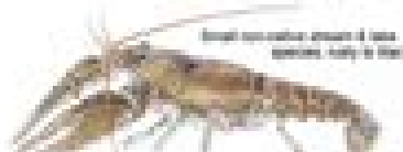
Orconectes obscurus Hickory Crayfish max. carapace length 10cm