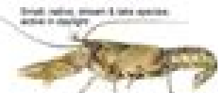
Orconectes propinquus Northern Copper Crayfish max. carapace length 10cm