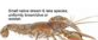
Cambarus bartoni Common Crayfish max. carapace length 10cm