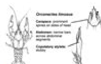
Orconectes limosus Carapace: prominent spine on sides of head Abdomen: narrow, jointed, with transverse carapide process Respiratory apophysis: short