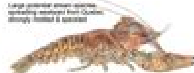
Orconectes limosus Common Crayfish max. carapace length 10cm