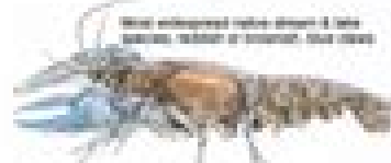
Orconectes virilis White Crayfish max. carapace length 10cm