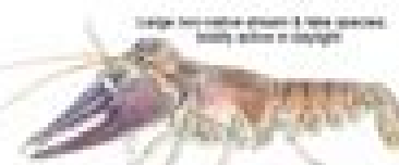
Orconectes rusticus Rusty Crayfish max. carapace length 10cm