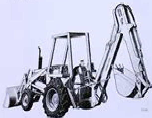
Figure 12 - Backhoe in Transport Position

CAUTION: Be sure the transport chains are in position before traveling on roads or between job sites. Keep tractor speed within safe limits to prevent the machine from tipping over around sharp curves, on hillsides or over rough terrain.