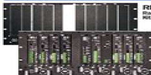
RPK88 Rack Mount Kit