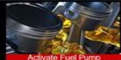
Activate Fuel Pump