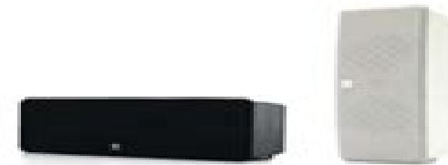
HS 225 mini and midrange

Horizon HS 40, 50, 60, 225 Bookshelf and LCR Speakers