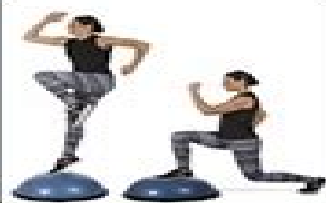
LUNGE POWER SKIP