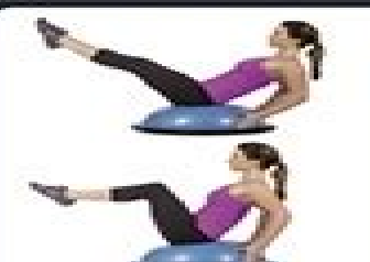
EXTEND AND TUCK