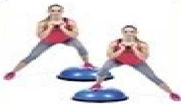
SPLIT SQUAT OVERS