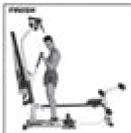
Standing Lateral Shoulder Raise