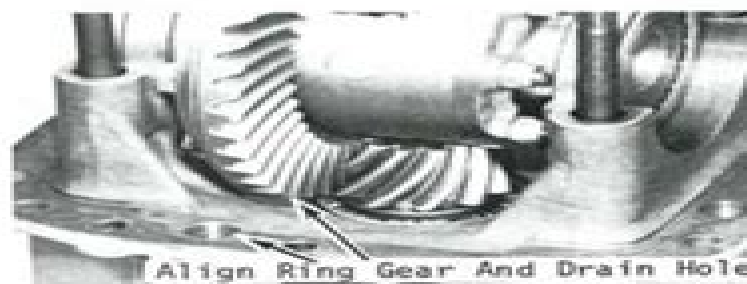
Align Ring Gear And Drain Hole