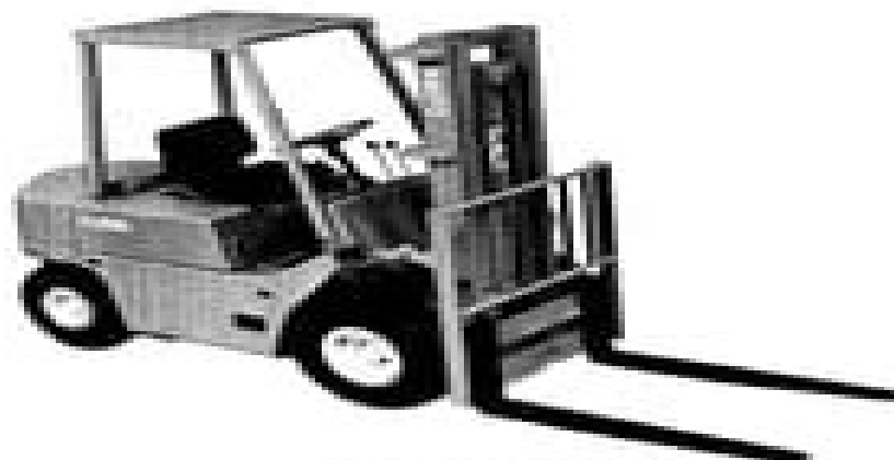
C500 35,740/L43,740/53,740 C500 8,300/8,400/8,500