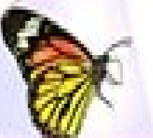
Image after enlargement