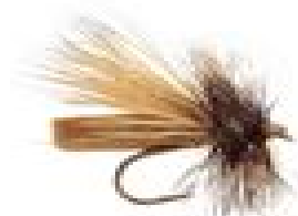
NEVER SINK CADDIS - TAN SIZE #14 X 1 SIZE #16 X 1