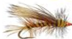
YELLOW STIMULATOR SIZE #10 X 1 SIZE #12 X 1