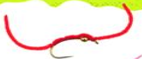
RED TUNGSTEN SQUIRMY WORMY SIZE #12 X 1