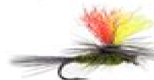
BWO PARACHUTE HI-VIS SIZE #16 X 1 SIZE #18 X 1