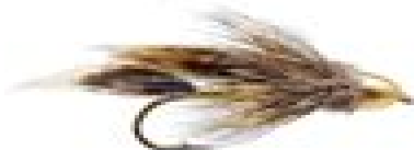
CONEHEAD MUDDLER MINNOW SIZE #10 X 1 SIZE #8 X 1