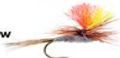
HI-VIS ADAMS PARACHUTE SIZE #12 X 1 SIZE #14 X 1 SIZE #16 X 1