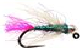
TUNGSTEN PINK TAG JIG SIZE #14 X 1 SIZE #16 X 1