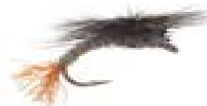
BWO FOAM EMERGER SIZE #18 X 1 SIZE #20 X 1