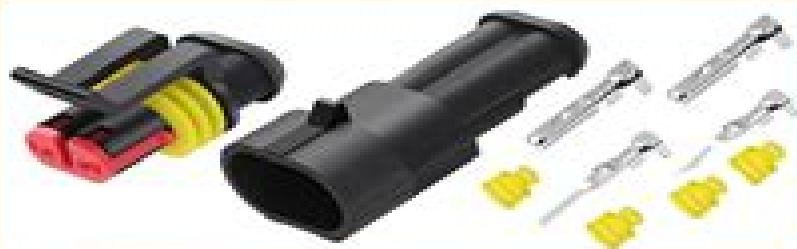
Copper core tinned terminal