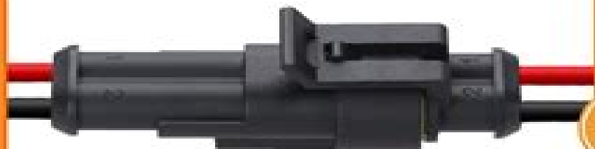
Safe and stable