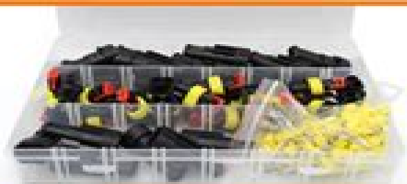
Sturdy and durable box packaging