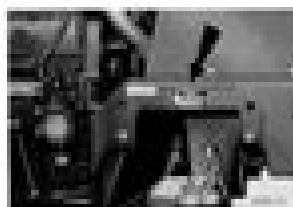
NOTE: Cool Air Inlet

The 344, 444 and 544 models have a Code B travel gear set.