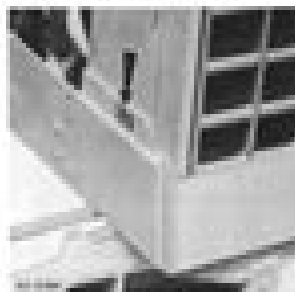
NOTE: Fabricated Inlet