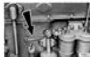
Engine Serial Number