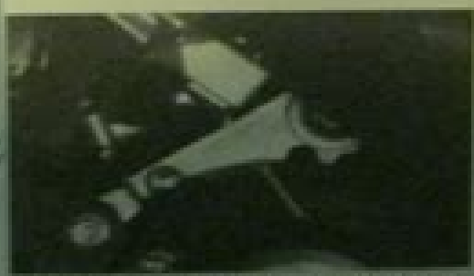
ENGINE SERIAL NUMBER LOCATION