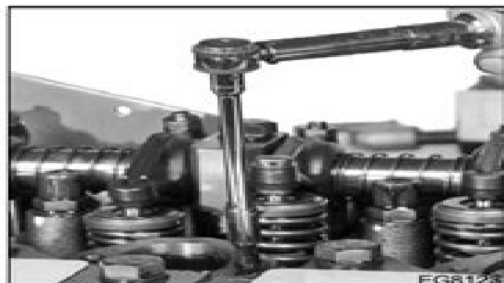
Figure 150 Install shoulder bolt