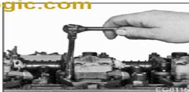
Figure 153 Tighten hold down clamp mounting bolt

CAUTION: To avoid engine damage, it is important that injector hold down clamp bolt be tightened to correct torque.