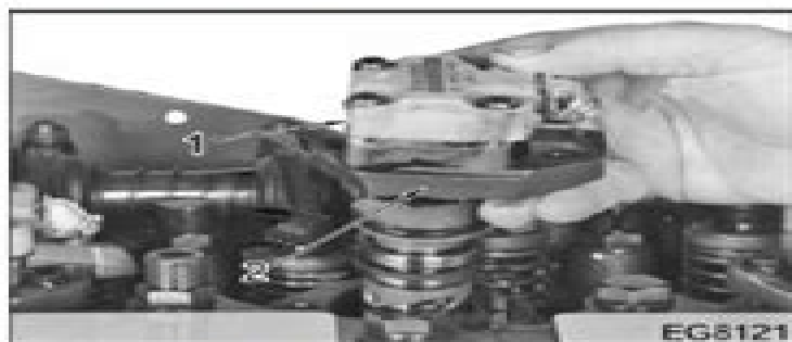
Figure 151 Install fuel injector

NOTE: Use hand pressure, applied to top of fuel injector, until hold down clamp can be engaged under head of shoulder bolt.