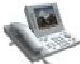
Cisco Unified IP Phone 9971