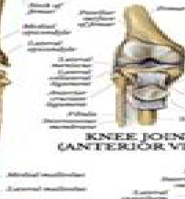
KNEE JOINT (ANTERIOR VIEW)