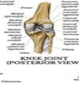
KNEE JOINT (POSTERIOR VIEW)