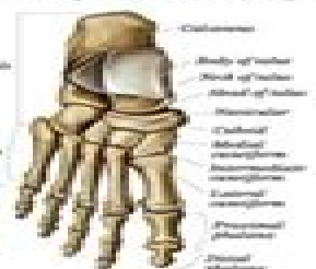
FOOT (DORSAL VIEW)