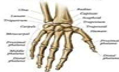
HAND (DORSAL VIEW)