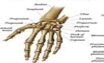
HAND (PALMAR VIEW)