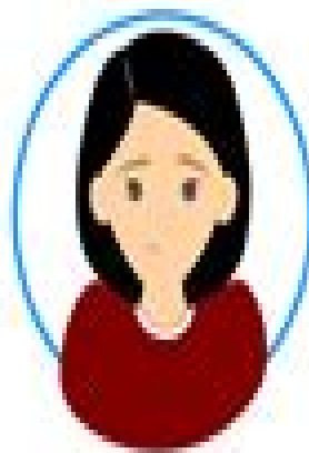
Unexpected weight loss