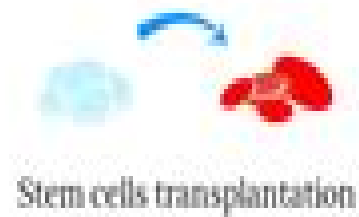
Stem cells transplantation