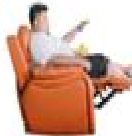
Consequences of a Sedentary Lifestyle