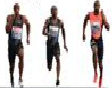
Energy Use, Diet & Nutrition