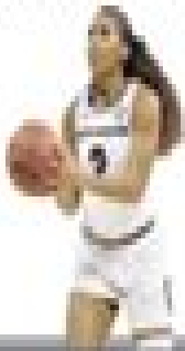
Health & Fitness