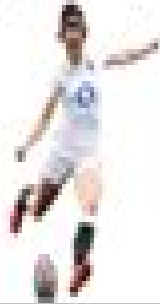
Well Being & Lifestyle Choices