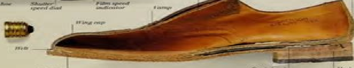
CROSS SECTION OF FINISHED SHOE