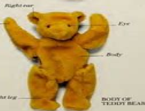
BODY OF TEDDY BEAR