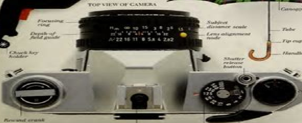
TOP VIEW OF CAMERA