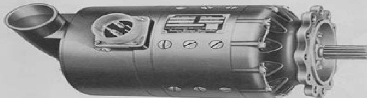
Fig. 36—Type O-1 generator assembly

The field frame consists of the frame with six pole shoes and six windings. The windings are connected in