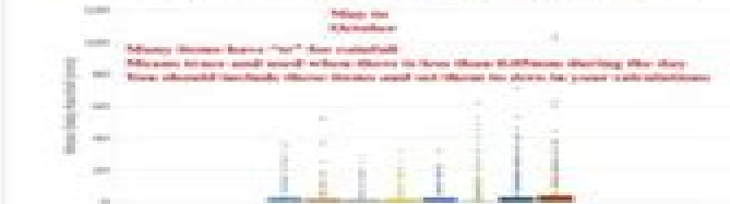
Monthly Rainfall May - Total rainfall in the month (mm)