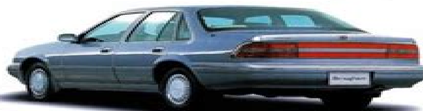
N·E·W Brougham 2000 DOHC

●ABS ●가죽시트(천연+인조) ●ECM방사기 ●천물/천물시트 54100 피코온 ●가격 : 14,000,000원