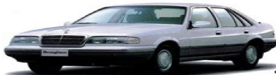
N·E·W Brougham 2000

●앞선내장 접어서 천물 방아미 ●물고로 에어컨 ●자동도어개폐 피코온 ●무드그라진 ●앞선시트 파워시트 & 조후방출장치 ●가격 : 12,100,000원