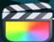
Final Cut Pro