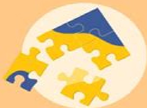
4. Working backwards