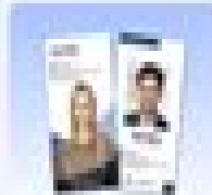
Photo Avatar Turn a photo into a talking avatar

Custom Avatar Create a personal avatar in minutes