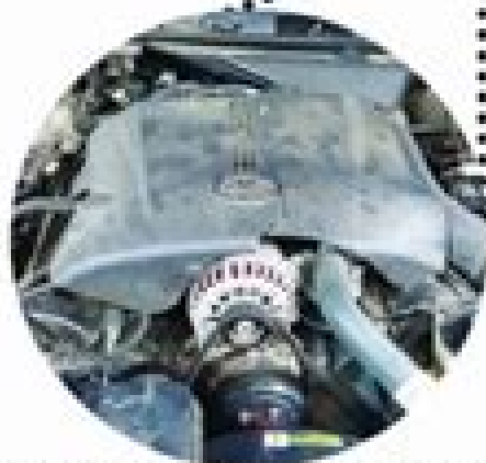
Issues with sensors found throughout the engine