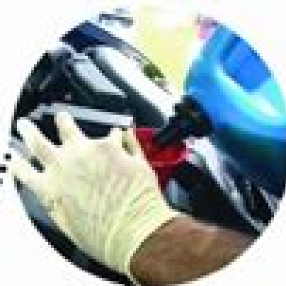
Low on oil