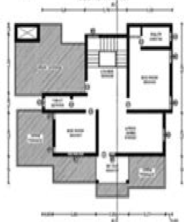
Floor plan in meters to 1:50