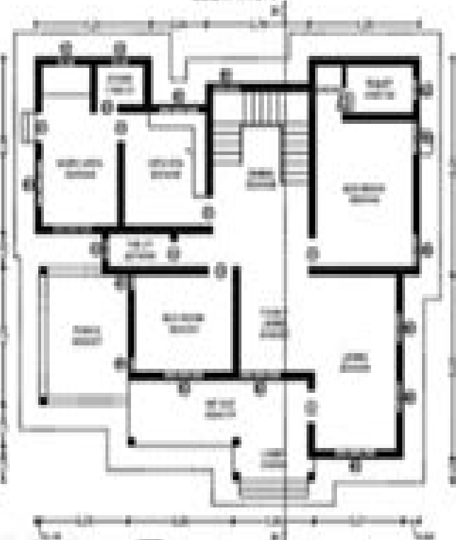
Floor plan in meters to 1:50