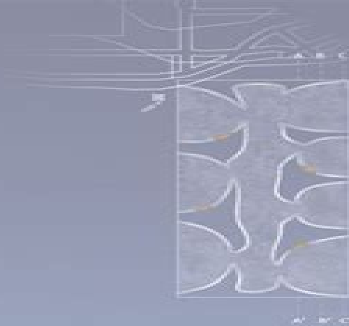
ground plan choice