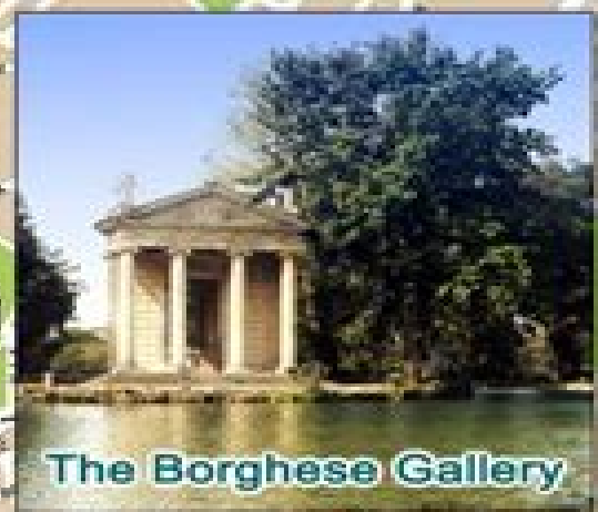
The Borghese Gallery