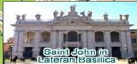
Saint John in Lateran Basilica