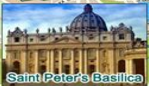
Saint Peter's Basilica