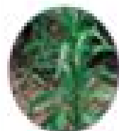
American Burnweed Erechtia lanceolata

Spreading, alternating, elliptic to lance-shaped leaves