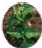
Oenothera Oenothera perfoliata

Small solitary flower heads, cylindrical, grayish roots