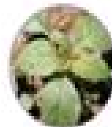
Pigweed, redroot Amaranthus retrofractus

The main stem does not have leaves, ascending stems contain flowers and leaves