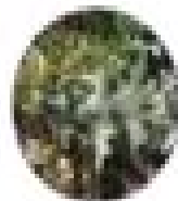
Canada Thistle, common Cirsium arvense

Rosette leaves divided into eight to 16 leaflets