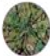
Barnyardgrass, common Echinochloa crus-galli

Smooth, yellow-green leaf blades with pointed or boat-shaped tips