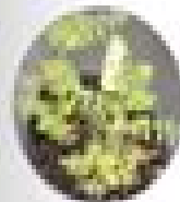
Phytolacca, long-stalked Phytolacca berularia

Daisy green, alternating, egg-shaped leaves