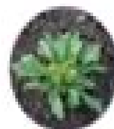
Hairyroot (Portulaca) Gnaphalium

Stemmed ones to two leaf pairs and opposite; mature leaves are alternate