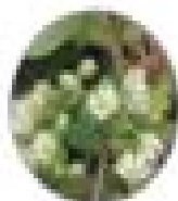
Chickweed, common Stellaria media

Strong, irregularly lobed leaves with spiny margins