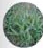
Foxtail, yellow Setaria viridis

Narrow, lance-shaped leaves with short sheaths