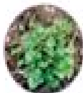
Bittercress, hairy Cardamine hirsuta

Spreading, alternating, elliptic to lance-shaped leaves