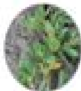
Knotweed, prostrate Polygonum aviculare

Leaves are pinnately lobed, alternating in direction along the length of the plant