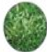
Annual Bluegrass Poa annua

Smooth, yellow-green leaf blades with pointed or boat-shaped tips