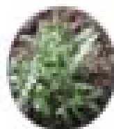
Groundsel, common Senecio vulgaris

Leaves are opposite with extremely toothed margins