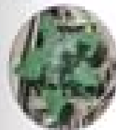
Lambquarters, common Chenopodium album

Smooth, blue-green leaves, sitting in linear-shaped