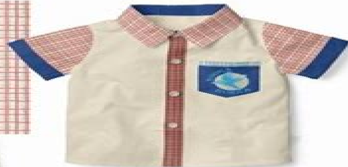
Campus buttons_ray flower