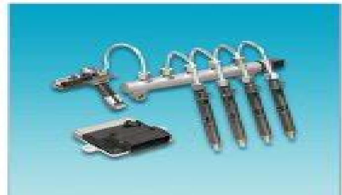
Delphi's second generation Diesel Unit Pump Common Rail System is in development.