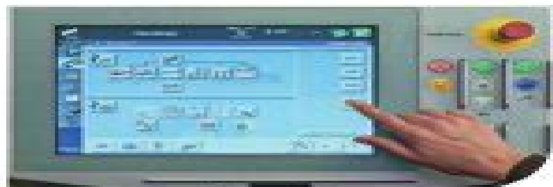
Graphic designed user interface

The software is operated via a spacious, user-friendly designed 15 inch touchscreen panel. Graphic representations of function cycles plus universally comprehensible symbols facilitate understanding of the selection possibilities. Direct access to important settings and to the electronically stored operating manual significantly reduces analysis time.