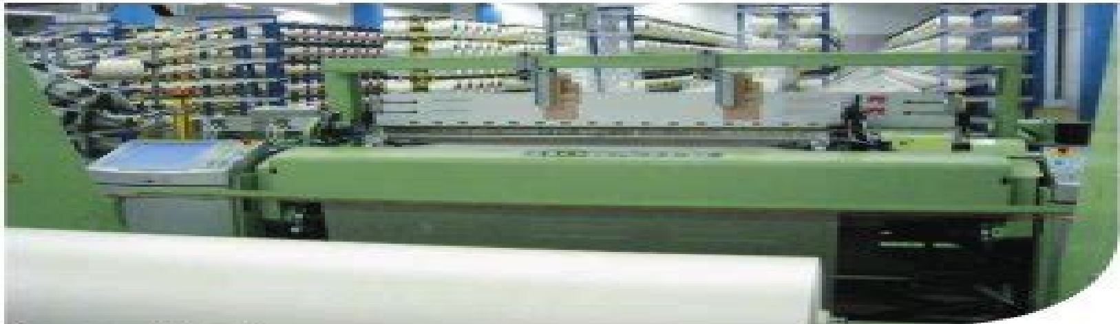
A1 air-jet weaving machine for tire cord

Increasing volume requirements and also higher claims on safety and performance for vehicle tires have necessitated the development of a modern, high-speed and high-precision tire cord weaving machine. The special characteristics of cord fabrics for motor car tires, but also for bicycle tires and other applications, mean that they claim a special status among industrial fabrics. The DORNIER A1 air-jet weaving machine meets the requirements in thoroughly convincing manner.