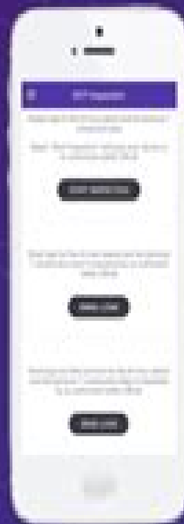
Tap "Start Inspection" for DOT Mode