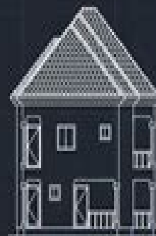
PROJECT WILL BE