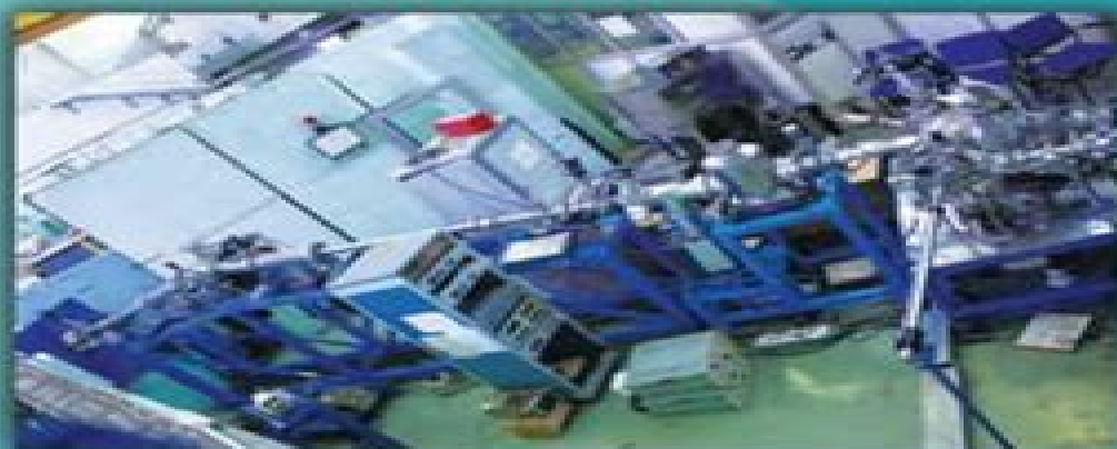
Photoelectron spectroscopy beamline