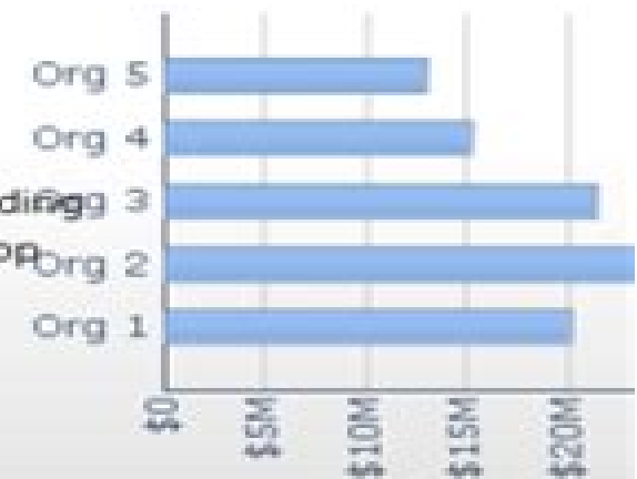
No Year Funding by Organization