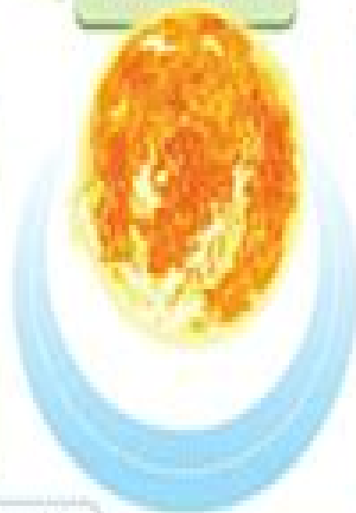
Diagram of the Earth Orbiting the Sun

Step 6: Draw a line indicating the moon orbiting the earth.