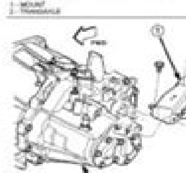
Fig. 118 Left Mount (Manual Transmission)