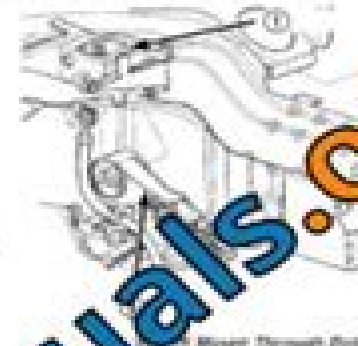
Fig. 115 Mount Through Bolt