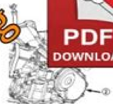
Fig. 117 Left Mount (Automatic Transmission)