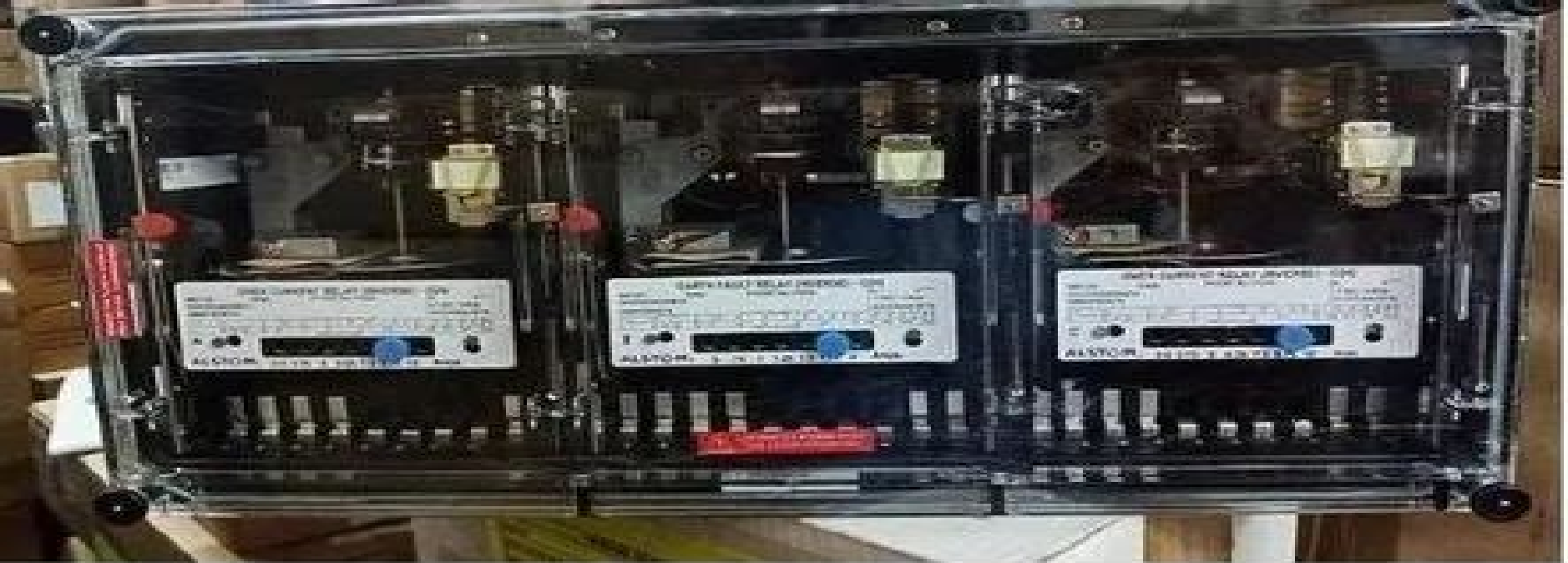
CDG31 & CDG61