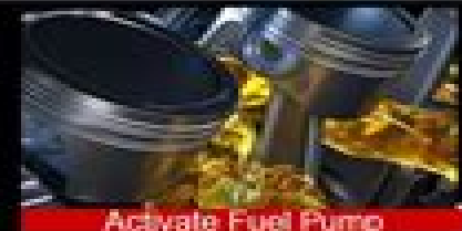
Activate Fuel Pump