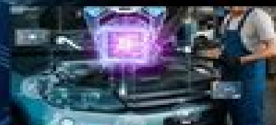
Recode Changed Modules