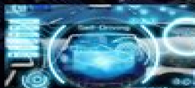
Refresh Hidden Functions