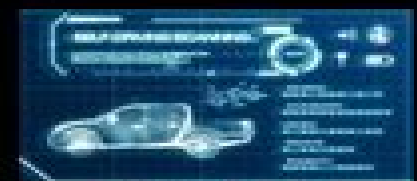
Optimize Vehicle Performance