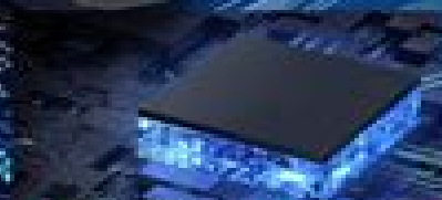
Reset Adaptive Data