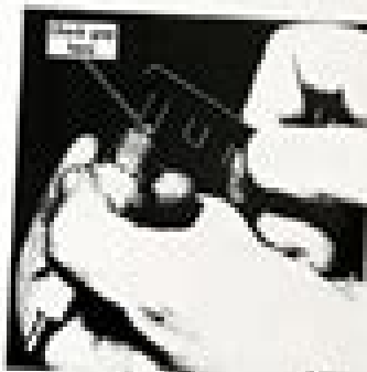
Item 16 Checking the spark plug gap. See page 10, diagram.

Be sure the gasket is in good condition, and screw the plug in tightly. Do not tighten more than enough to compress the gasket to seal the plug and secure a good seal between the plug and the cylinder head. Tighten the plug 1/4 to 1/2 turn past finger tight.