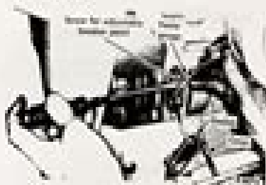
Item 18 Adjusting the breaker points. See page 10, diagram.