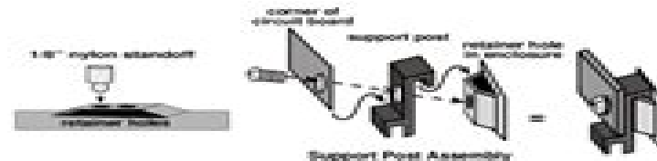
Figure 4: Standoff and Support Post Installation

Once the control board is installed, be sure to connect the supplied ground wire between the door and the enclosure using the supplied nuts. A second ground wire is provided for connecting AC power ground. Both grounds connect to the stud in the enclosure to the left of the circuit board.