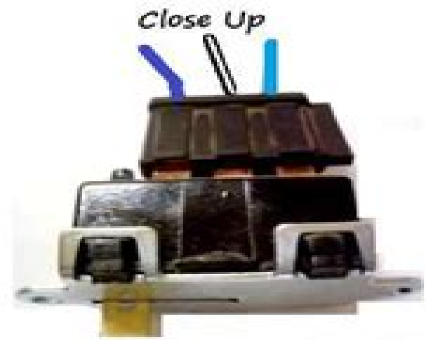
1973-1976 Wiper Motor Schematic Made Simple