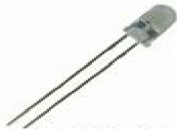
Light Emitting Diode