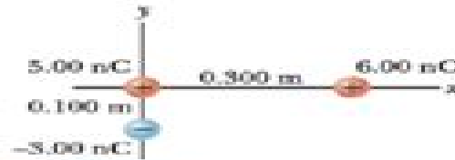
Figure P23.11 Problems 11 and 35.